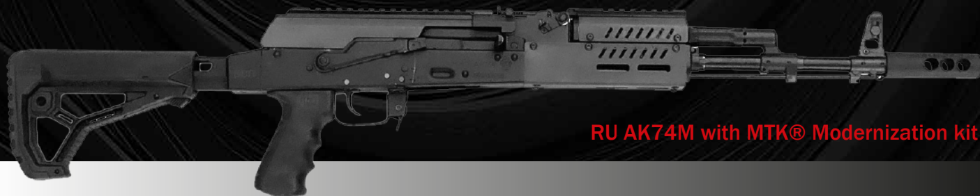
RU AK74M with MTK® Modernization kit