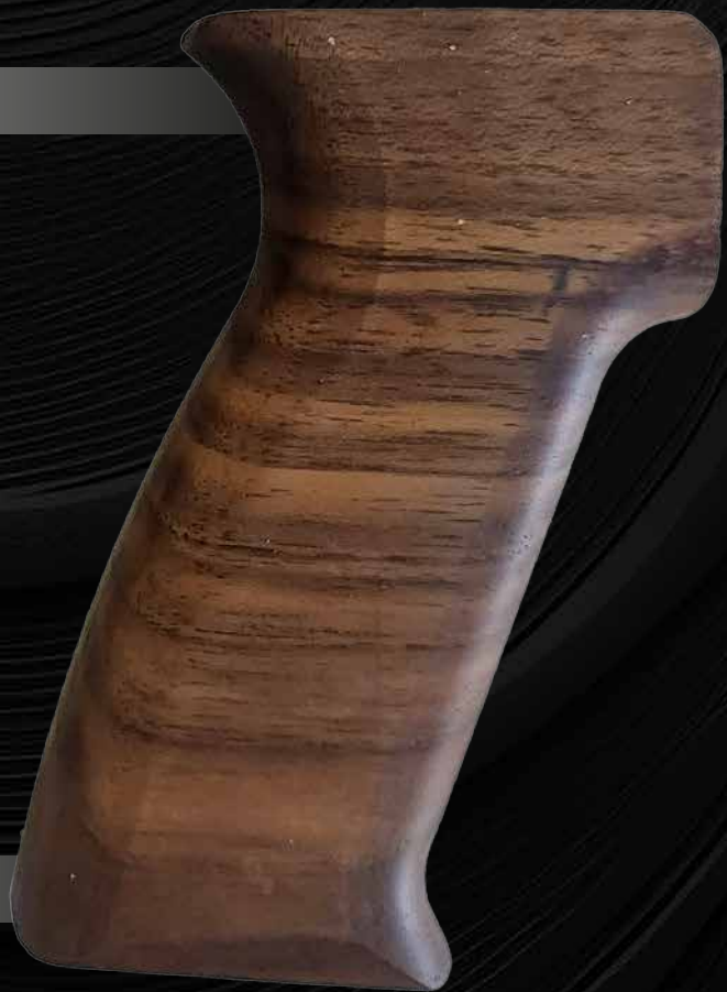
SVD grip natural walnut color: MTK-GRIP-SVD-1