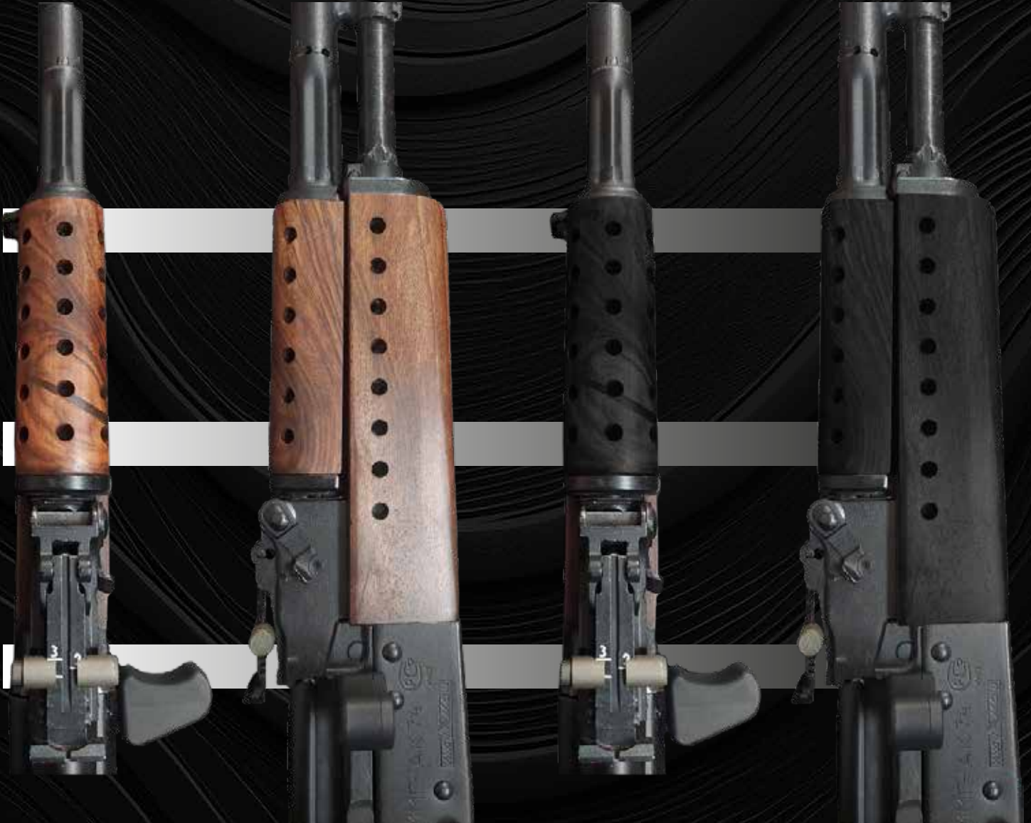
AK handguards in natural walnut color: MTK-WHG2