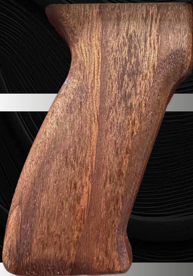
AK grip natural walnut color: MTK-GRIP-AK-1