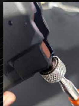
Steel front tooth

Mil-spec production, made in high-grade polymer with internal steel frame. Front and back locking tabs are steel. Classic 30nds. They are available in the following calibers: .223 REM, 5,45x39 and 7.62x39.