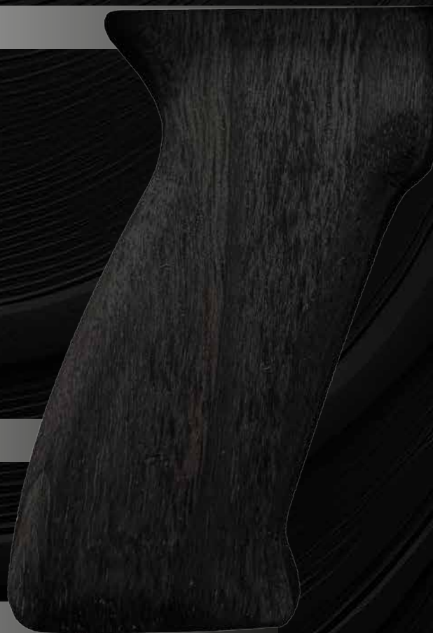
AK grip tactical black: MTK-GRIP-AK-2

CNC machined from select walnut blocks, available in natural color or in tactical black. Compatible with any AK model. Its shape is inspired by the 1911 pistol grip profile and provides terrific ergonomics. It uses the standard screw, but a more practical Allen key screw is provided.