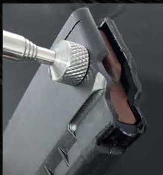
Steel reinforcement cage