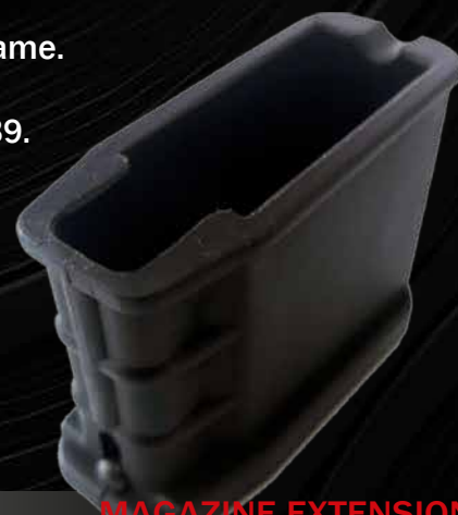
MAGAZINE EXTENSION MTK-ME-223-545-10

Our exclusive device, available only for 5.45 and 223, it increases the magazine capacity by 10 rounds. No spring replacement is required. Very simple to install. No mag modification is required, so it can be taken easily and quickly removed. It is proprietary and works only with MTK® magazines.