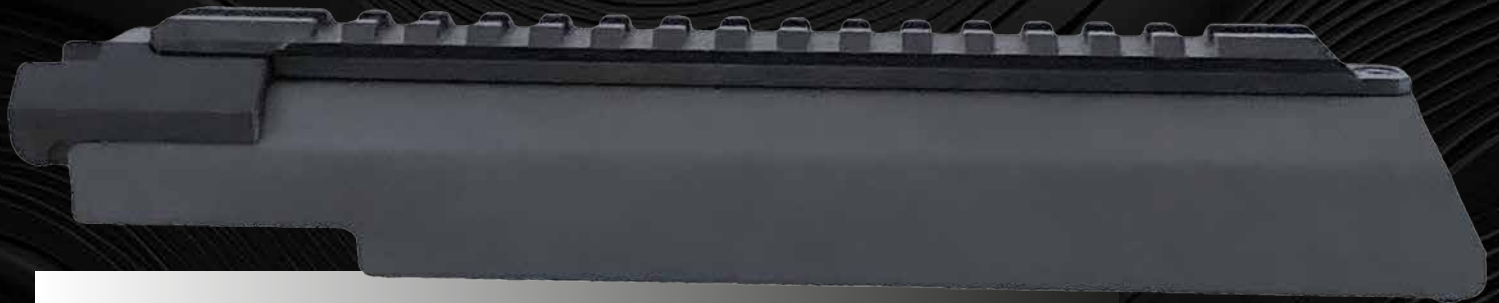
MTK-WGDC22 - MTK-WGDC24