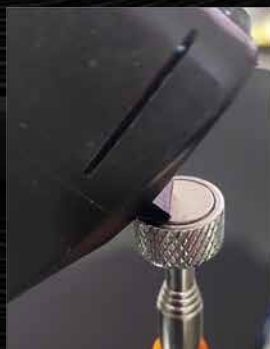
Steel rear tooth