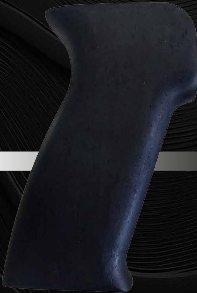
SVD grip tactical black: MTK-GRIP-SVD-2